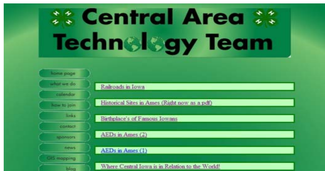
Central Iowa Area 4-H Tech Team Website (Sample Maps)

Central Iowa Area 4-H Tech Team member maps can be found at their website at: www.centralareatechteam.org .