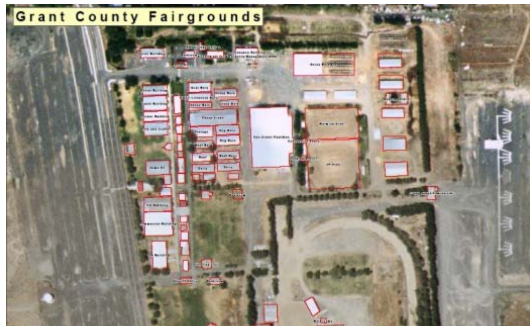
Figure 5: A map of building locations within the Fairground

Beth Carpenter, GISP - GIS Coordinator/City of Sammamish, WA